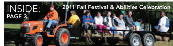
INSIDE: PAGE 3