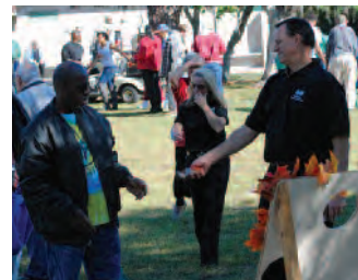
Blue Cross & Blue Shield of Florida employees facilitated all of the event's games.

L'Arche Arc of the St. Johns Arc Jacksonville Adams Acres St. Augustine Center for Living New Heights